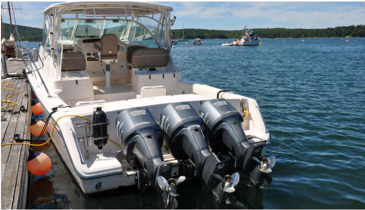
Grady White 360 Express

Below are a few of our most recent sales!