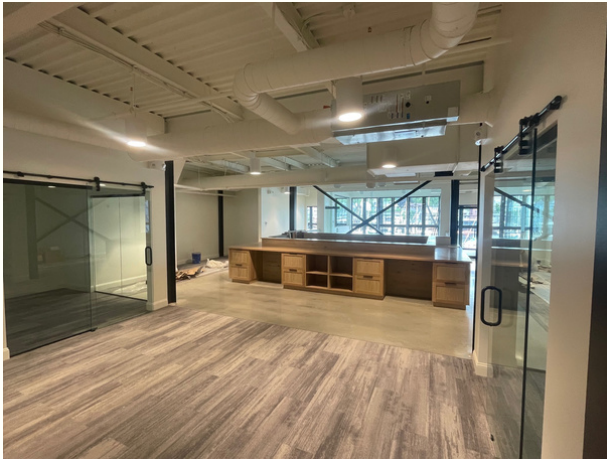
LM administration offices