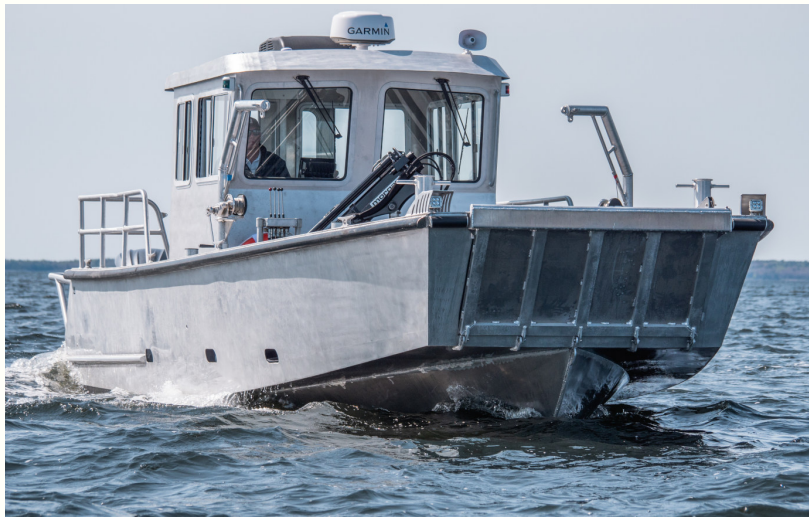
LMF 33 LC

The LMF 33 Landing Craft was designed with commercial use in mind. The aluminum hull allows for operators to land the boat on rocky beaches without worrying about damaging the hull, while the wide open bow acts as the perfect work space. Hull No.1 was built for the University of New Hampshire's aquaculture research program which required a 3300lb crane to be mounted on the deck for easy hauling of nets/traps.