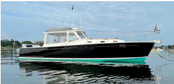
"Fins" MJM 40Z - Erik