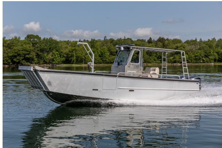
LMF 28 LC

Equipped with twin Yamaha 250's, this vessel will see cruise speeds in high 20's and 40+ knots WOT